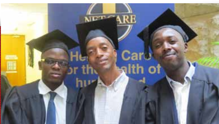
Below: The joy of graduating was evident on many of the young faces at the event