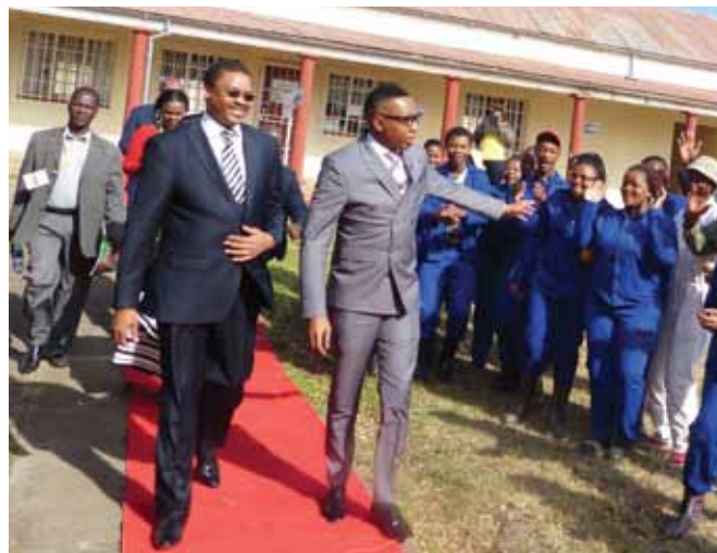
Left: Learners welcomed the dignitaries to the event with song and dance.